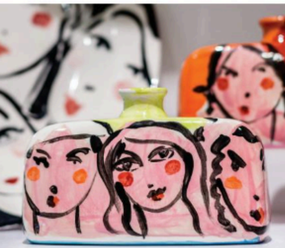
Cornell Museum Store

Take your holiday shopping to another level with a gift that makes a difference. And is local. Adopt one of the animals at the Sandoway Discovery Center, like See-More, an eastern screech owl who sustained an injury that makes his return to the wild impossible. All of the animals at the nature center have unique and changing needs, and each adoption gift directly supports their care and feeding ( sandoway.org ). For a colorful one-of-a-kind gift, consider shopping at Fall Art on the Square (Nov. 9-10) on the grounds of Old School Square, or visit the Museum Store at the Cornell Art Museum, where you'll find an array of handcrafted gifts ( cornellartmuseum.org/shop ). And a membership in the Delray Beach Historical Society is a gift that could be enjoyed all year.